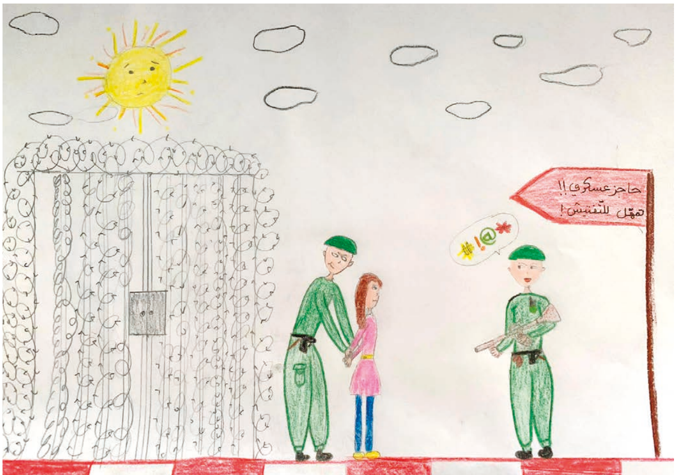
Signpost reads: 'Military checkpoint, slow down to be searched!'

The report concluded with 40 specific recommendations in relation to arrest, interrogation, bail hearings, plea bargains, trial, sentencing, detention, complaints and monitoring. The West Bank-based organisation, Military Court Watch stated in June 2020 that after eight years, only one of the recommendations (number 33: separation of children from adults in detention) has been substantially implemented. This gives an implementation rate of just 2.5%. 53